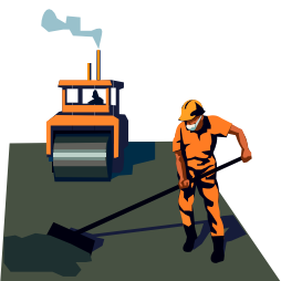
Asphalt & Asphaltic Materials